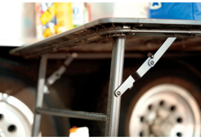
This Front Runner table is a no-nonsense workhorse, and its stainlesssteel surface is a convenient height for food prep or other standing tasks. Don't let the slim profile of the Pro fool you; its build quality is solid.

South African overlanding equipment manufacturer, Front Runner Outfitters, makes many off-road vehicle accessories, from modular roof rack systems to storage containers and even auxiliary vehicle lighting. They also offer a number of durable camp tables, including their Pro stainless steel camp table.